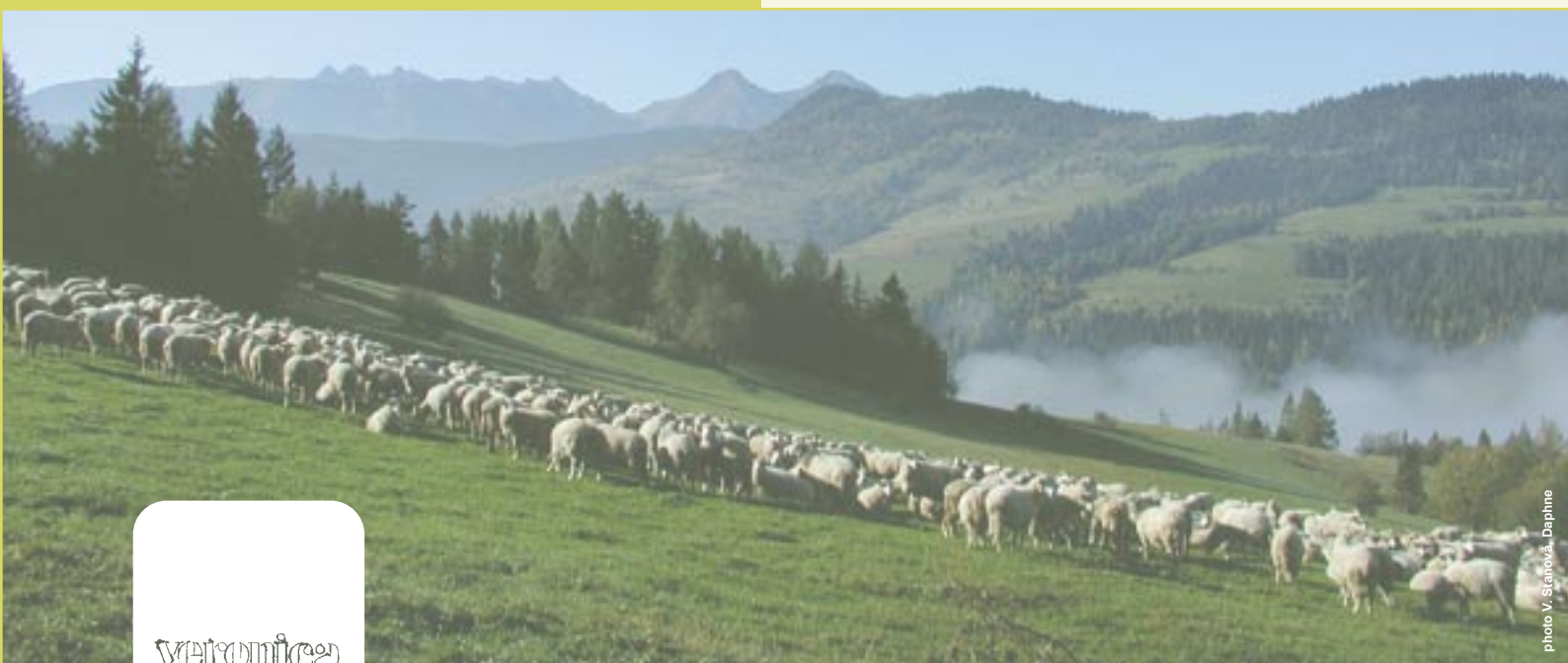
Daphne