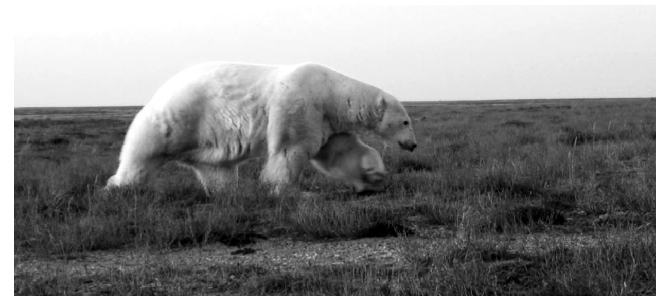
Figure 1 . Adult male polar bear apparently in poor body condition sighted along the Ontario coast near Fort Severn, fall 2005.

Standard morphometric measurements were taken, including straight-line body length (SLBL) and total body mass (TBM). SLBL was measured to the nearest centimetre as the dorsal straight-line distance from the tip of the nose to the end of the last tail vertebra using a metal measuring tape. All bears were measured while sternally recumbent with the back legs extended behind and the front legs forward. TBM was measured to the nearest 500 g by suspending the bear from either a spring-loaded weigh scale (1984-86), or an electronic load cell scale (2000-05). During weighing, bears were placed in a semi-supportive sling and lifted by chain pulley until clear of the ground (Fig. 3). A Body Condition Index (BCI) value (Cattet et al. 2002) was calculated for each