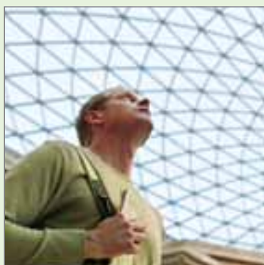
Visitor at the Games

Travelling around the Olympic Park is easy. The Park itself is wonderful and I enjoy spending time by the river. I am not famous so people don’t bother me for my autograph, although yesterday I did meet some spectators who were originally from my neighbouring village, but are now living in London – a home audience for me half way around the world!”