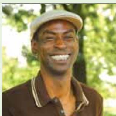
Legacy Community Resident

This morning we all went to the main stadium to watch the heats for the relays, before getting some lunch and sitting down by the river to watch the events on the big screen. The volunteer we asked was very helpful in directing us to a nice place to eat and explained what to do with our waste afterwards to make sure it was recycled.”