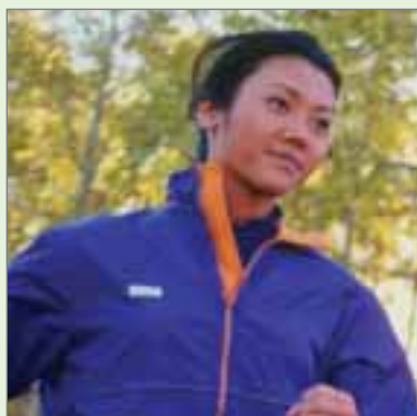
Competitor at the Games

“I was at school on the other side of the world when London was named as the Host City for the 2012 Games, and I have worked hard for the last seven years to stretch my performance and improve my efficiency – it is clear that London has been doing the same.