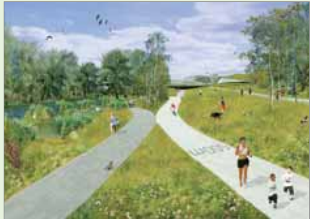
The Olympic Park, a lasting sporting and environmental legacy.

The provision of appropriate and timely training and information will be critical in ensuring that the sustainable policies and services are implemented. This will relate both to internal Organising Committee staff and volunteers, and to key external players including suppliers, contractors and venue managers.