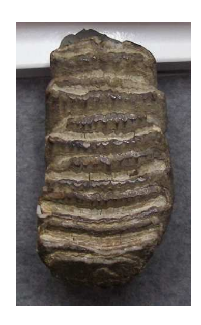
Plate 2 The Belait molar (M 10237) occlusal view.