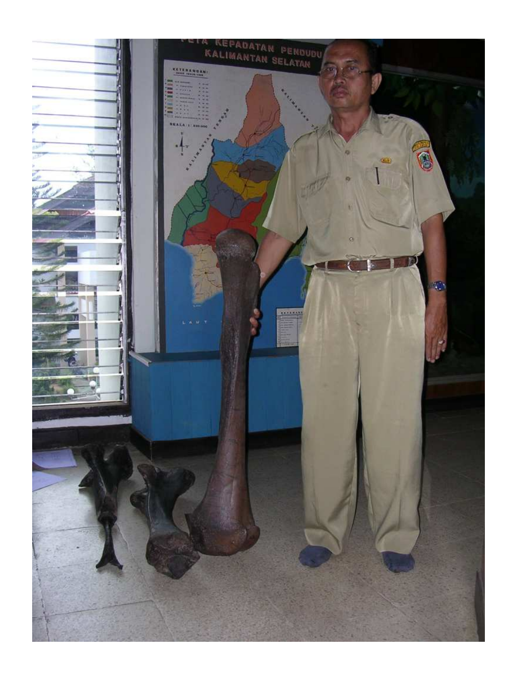
Plate 6 The Elephas bones in Museum Lambung Mangkurat, Banjarbaru, South Kalimantan"