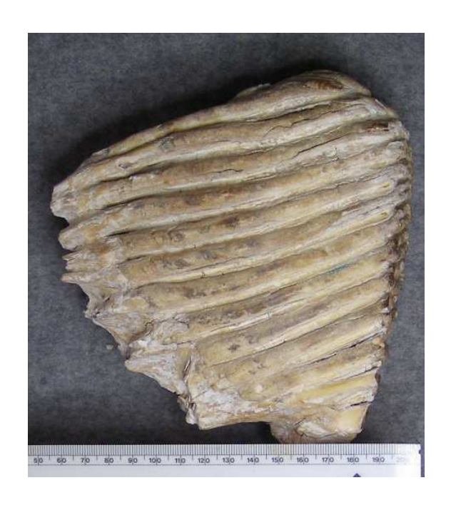
Plate 3 The Niah tooth, lateral view