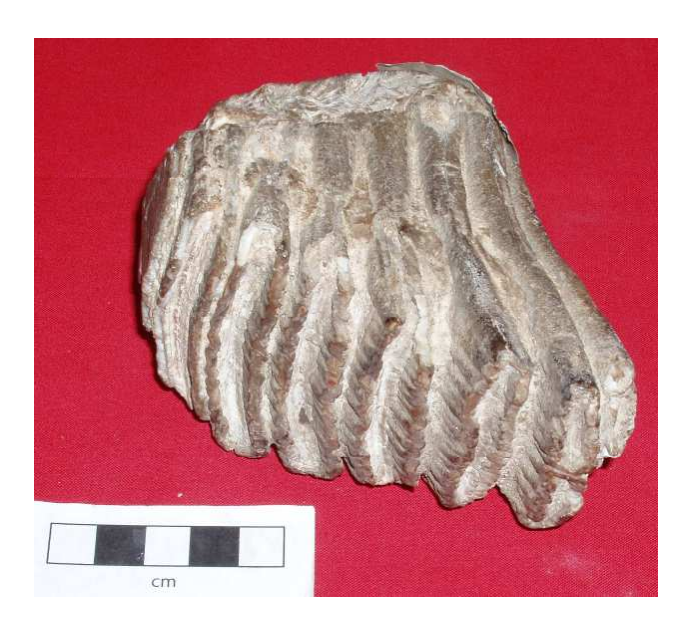
Plate 1 The Belait molar (M 10237 ) lateral view.