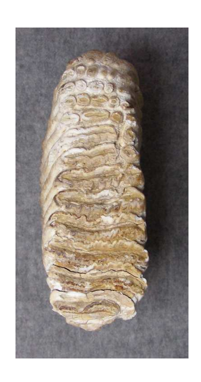
Plate 4 The Niah tooth, occlusal view