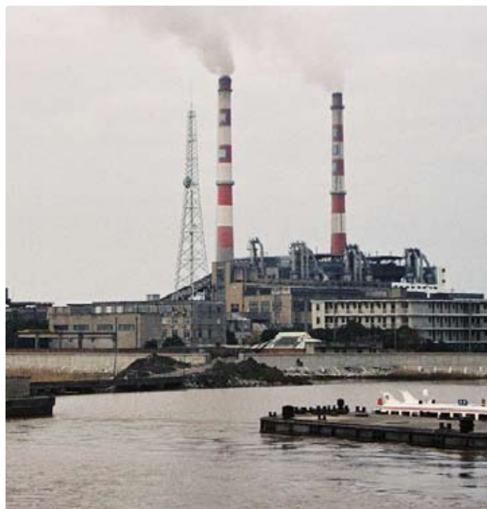
Air and water pollution in Jiangjiazui Town, West Dongting Lake, China.