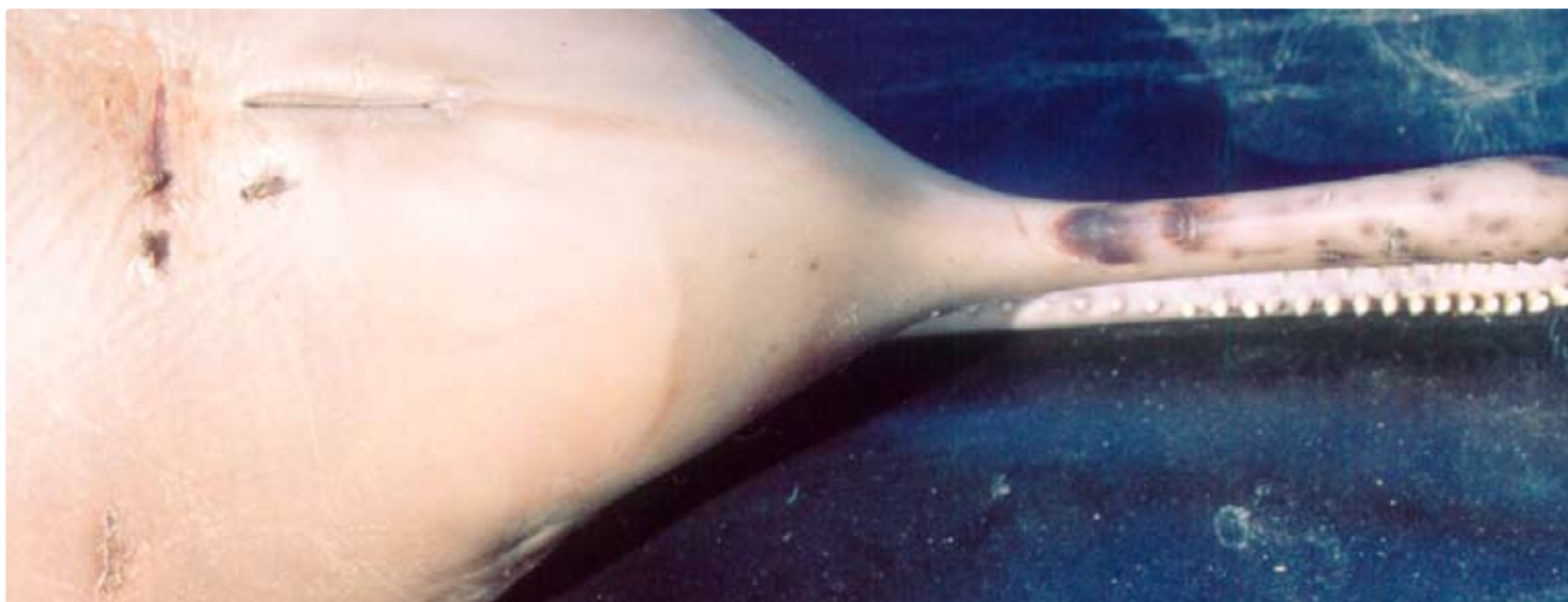
Indus river dolphin found dead due to entanglement in fishing net. Indus River, Pakistan.

Noise and congestion caused by boats can also be a serious problem. The rivers in which cetaceans live are often very muddy, so the animals rely primarily on echolocation to navigate and find food. Noise pollution can interfere with this. High traffic and harassment by tourist boats in some rivers causes stress in dolphins and can lead to collision with boat propellers. ▶