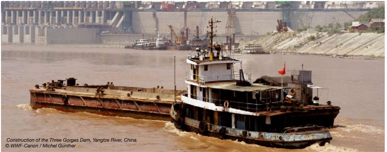
Construction of the Three Gorges Dam, Yangtze River, China.

Other human activities, such as clearing of river banks, deforestation, sand mining, dredging, and land reclamation, particularly along the Yangtze, have also contributed to the decline in both the quality and quantity of freshwater cetacean habitat, while overfishing has reduced their food supply.