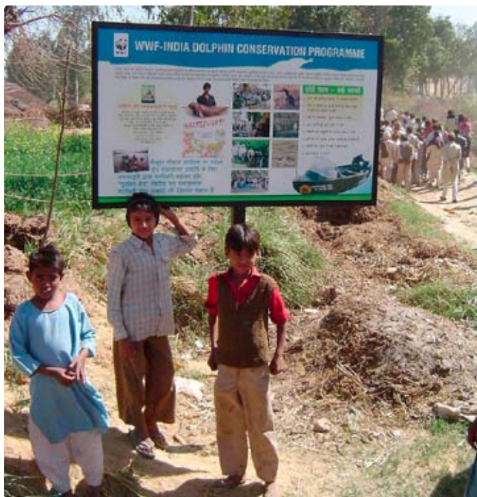
Children in front of a sign about conservation of the Ganges river dolphin, Farida village, Uttar Pradesh, India.

9. WWF also works to phase out and ban the most hazardous industrial chemicals and pesticides, which contaminate people and wildlife including freshwater cetaceans, and to identify and promote safe, effective, and affordable alternatives.