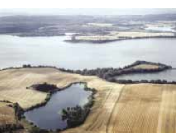
Intensive agriculture around the Parchim Lake Nature Reserve Northern Germany

Without water, there is no life. Agriculture withdraws the vast majority of water taken from rivers, lakes and underground sources. Water is delivered through irrigation systems using methods that range from the simple to the elaborate: a farmer drawing water from a well, to the Indus Basin Irrigation system which distributes water over more than 14 million hectares, an area about the size of England. Making the required amount of water available is only possible in many cases through the damming and diversion of rivers and extensive pumping of underground aquifers, often destroying the very ecosystems that make agriculture possible.