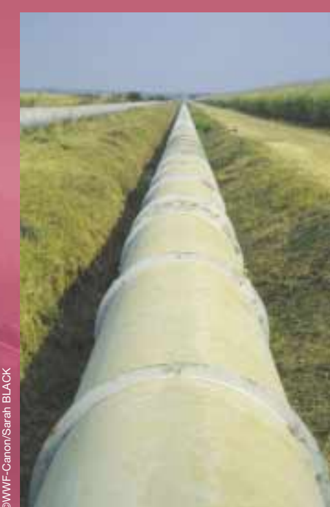
Kafue Flats, Zambia. Water supply (from the Kafue River) to sugar cane fields

As a result, unsustainable agriculture harms the environment by sucking rivers, lakes and underground water sources dry, increasing soil salinity and thereby destroying its quality, and by washing pollutants and pesticides into rivers destroying downstream ecosystems as far as corals and breeding grounds for fish in coastal areas. Disruption to marine ecosystems is at least as important as that in rivers, with both suffering from changed flood and sediment regimes and blocked migration routes created by dams. Ultimately unsustainable agriculture destroys the livelihoods of the farmers practicing it, and of fishermen and communities dependent on natural ecosystems.