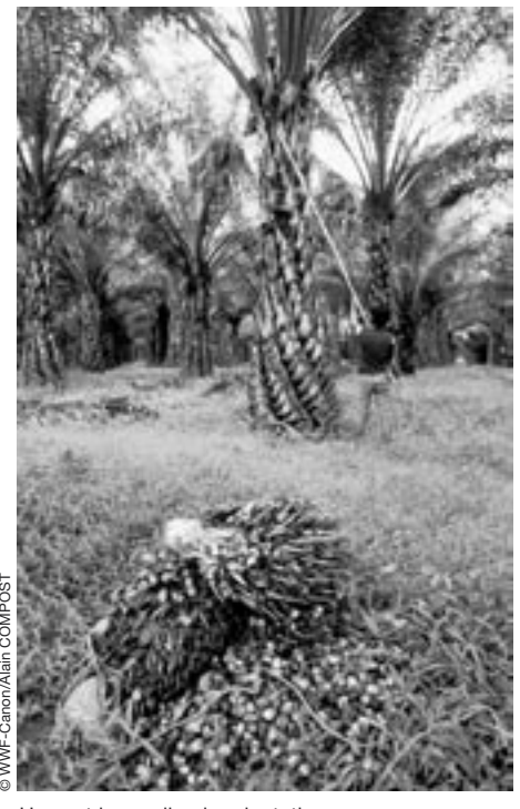
Harvest in an oil palm plantation.

Oil palm and soy expansion has had significant direct and indirect impacts on the environment. This is clearly demonstrated by the cases of Indonesia and Brazil. The most direct impact in these countries has arisen through the felling, clearance and burning of natural vegetation and its replacement by oil palm or soy agriculture. This has resulted in the loss of approximately 2 million ha of tropical forest in Indonesia by 1999, and the loss of vast areas of Cerrado vegetation in the Centre-West region of Brazil. The tropical forests of Indonesia and the Cerrado vegetation of Brazil are important living spaces for a rich plant and animal live and are home to a number of endangered species including the orang-utan, Sumatran tiger, Sumatran elephant, the maned