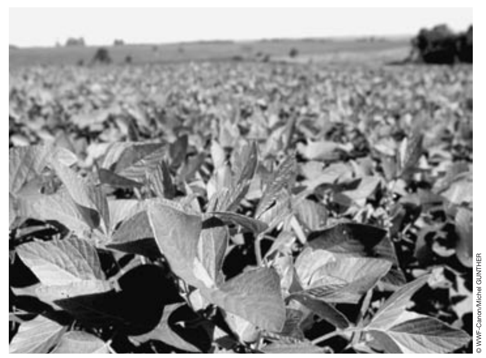
Soy field in Brazil.

Oil palm and soy expansion is interlinked to a number of other activities known to be causing critical habitat loss. In Indonesia and Brazil, oil palm and soy companies have been linked to devastating forest fires, that in 1997-98 alone destroyed over 11.7 million ha of forest and other vegetation in Indonesia, and 3.3 million ha of forest and other vegetation within the northern Amazonian state of Roraima, Brazil. Oil palm expansion has also inadvertently resulted in the clear-cutting of tropical hardwoods in areas designated for oil palm; and soy expansion in Brazil is linked to charcoal production and cattle ranch expansion.